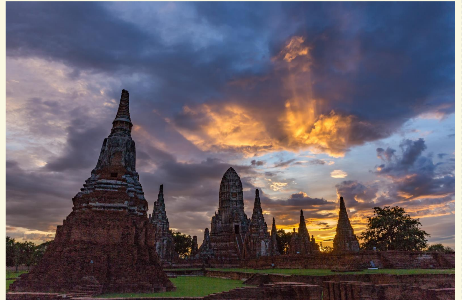
Fig. 3. Ayutthaya, Thailand.

We are going organize "The 18th International Conference on Multi-functional Materials and Applications" on 28-30 November 2024 in King Mongkut's Institute of Technology Ladkrabang (KMITL), Bangkok, Thailand. The Detail information of the conference is shown in our official webpage: https://icmma2024.org . In view of your reputation in the field of Chemistry, Physics, Materials Science and Engineering, Construction and Environmental Materials, we would like to invite you to participate in the conference, present and share your valuable research achievements to our participants.