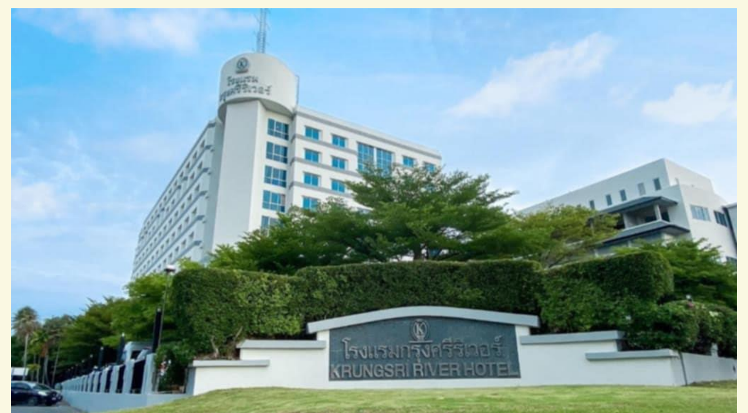
Fig. 4. Title of the Figure. (16 point font)

ICMMA 2024 will not make contract-hotels for participants. However, if you need ICMMA 2024 help to book hotel, please inform us through Email